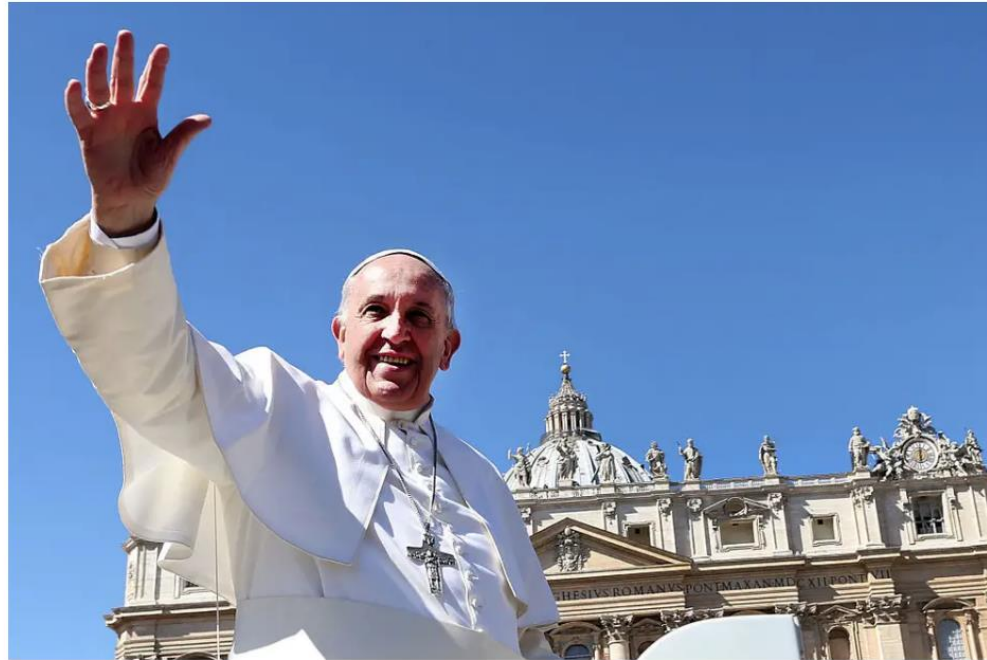
Pope Francis waves to the faithful as he leaves St. Peter's Square at the end of Palm Sunday Mass on March 29, 2015 in Vatican City, Vatican.

■ Pope Francis recently warned Silicon Valley executives about the moral implications of technology at a Vatican conference.