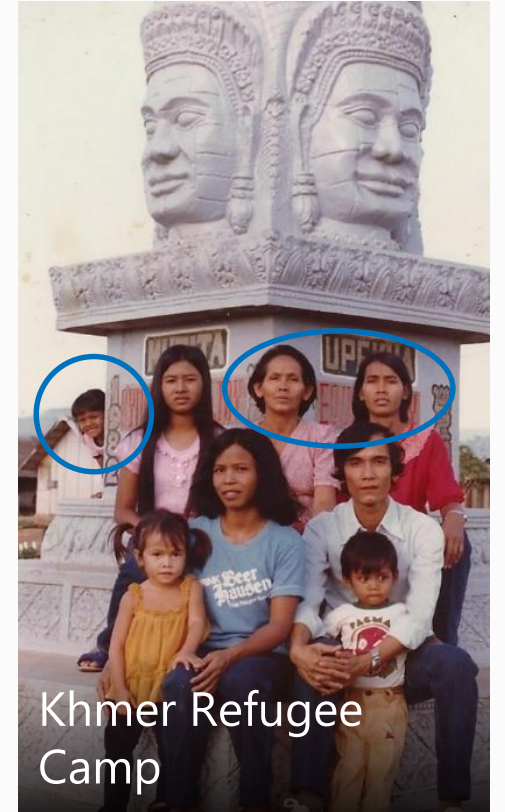
Khmer Refugee Camp