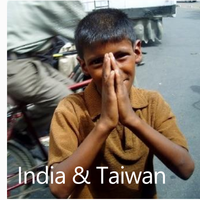
India & Taiwan