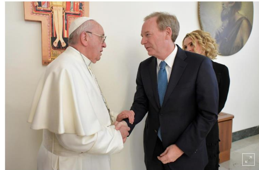
Microsoft President and Chief Legal Officer Brad Smith meets with Pope Francis at Saint Martha's House at the Vatican, February 13, 2019.

VATICAN CITY (Reuters) - Microsoft President Brad Smith met Pope Francis on Wednesday to discuss the ethical use of artificial intelligence and ways to bridge the digital divide between rich and poor nations, the Vatican said.