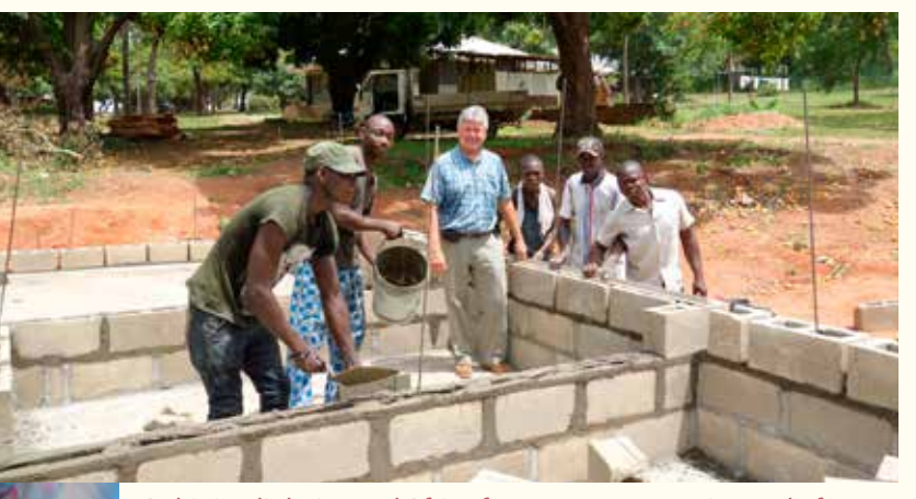
A shining light in rural Africa for 65 years... now in need of outside support in preparation for the next 60 years.